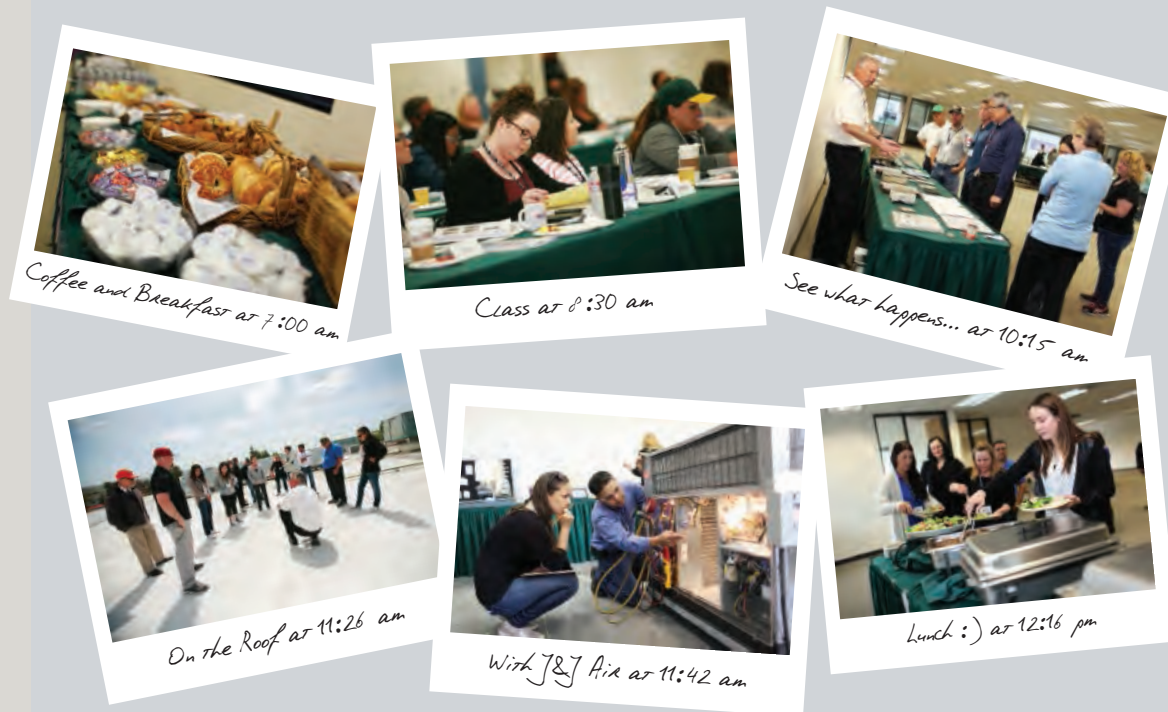
Coffee and Breakfast at 7:00 am

Phone: (408) 920-0662 Fax: (408) 920-8087